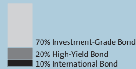
Chart II: Suggested Portfolio Diversification—Fixed Income

While you should always keep in mind the special risks of international investing, you should also consider its significant advantages. Diversifying internationally or globally can help smooth the fluctuations of your fixed-income portfolio and can offer a way to take advantage of yields that may be higher than in the U.S.